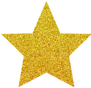
2024 Millner School Enrolments